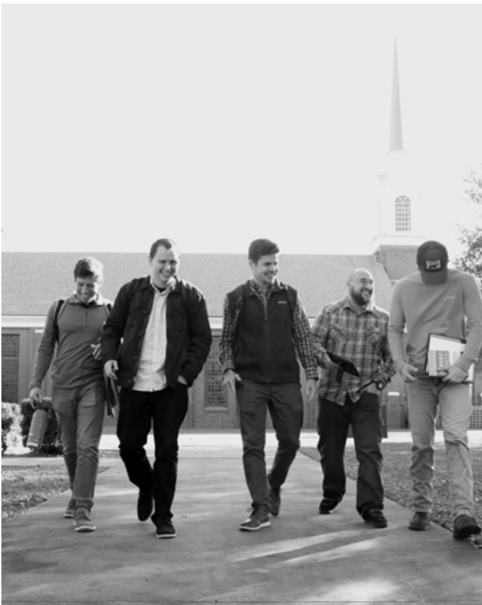
BCF students leaving the R.G. Lee Chapel and headed to class.

An intensive evaluation of a student's learning in graduate studies. The course will consist of a major research project based on an area of music and worship. The course will culminate in the successful defense of the student's thesis before a graduate committee. Three semester hours credit.