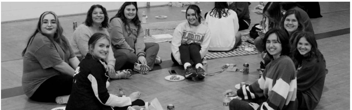
BCF students enjoy pizza and fellowship on the floor of the Wellness Center.