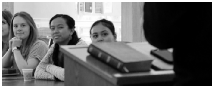
BCF students are equipped with knowledge grounded on the truths of God's Word.

NOTE: FOR INFORMATION ABOUT STUDENT HOUSING, SEE THE STUDENT LIFE SECTION OF THIS CATALOG.