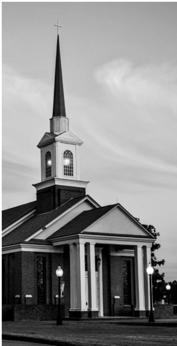
The R.G. Lee Chapel